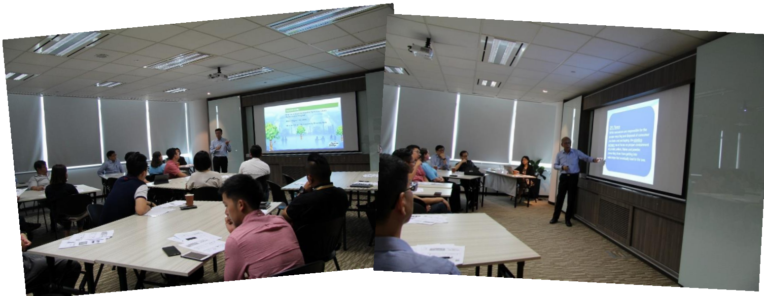
Operation Clean Sweep Good Practices Sharing Session held on 23 Aug

“A global voluntary product stewardship programme designed to support chemical companies across the plastics value chain in the drive to achieve zero pellet, flake and powder loss in their operations”